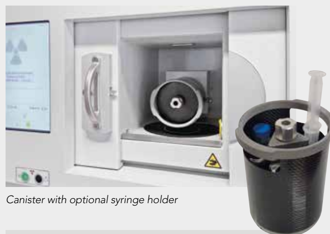
Canister with optional syringe holder