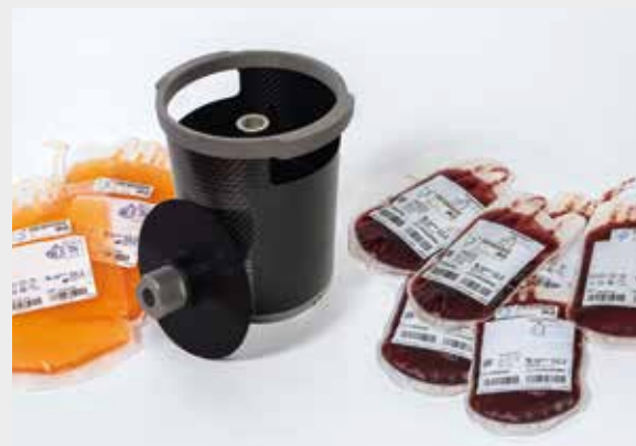
Carbon fibre canister